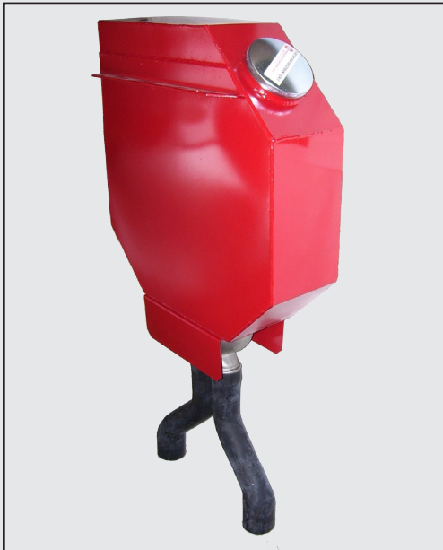
Red Steel N-661 Sander